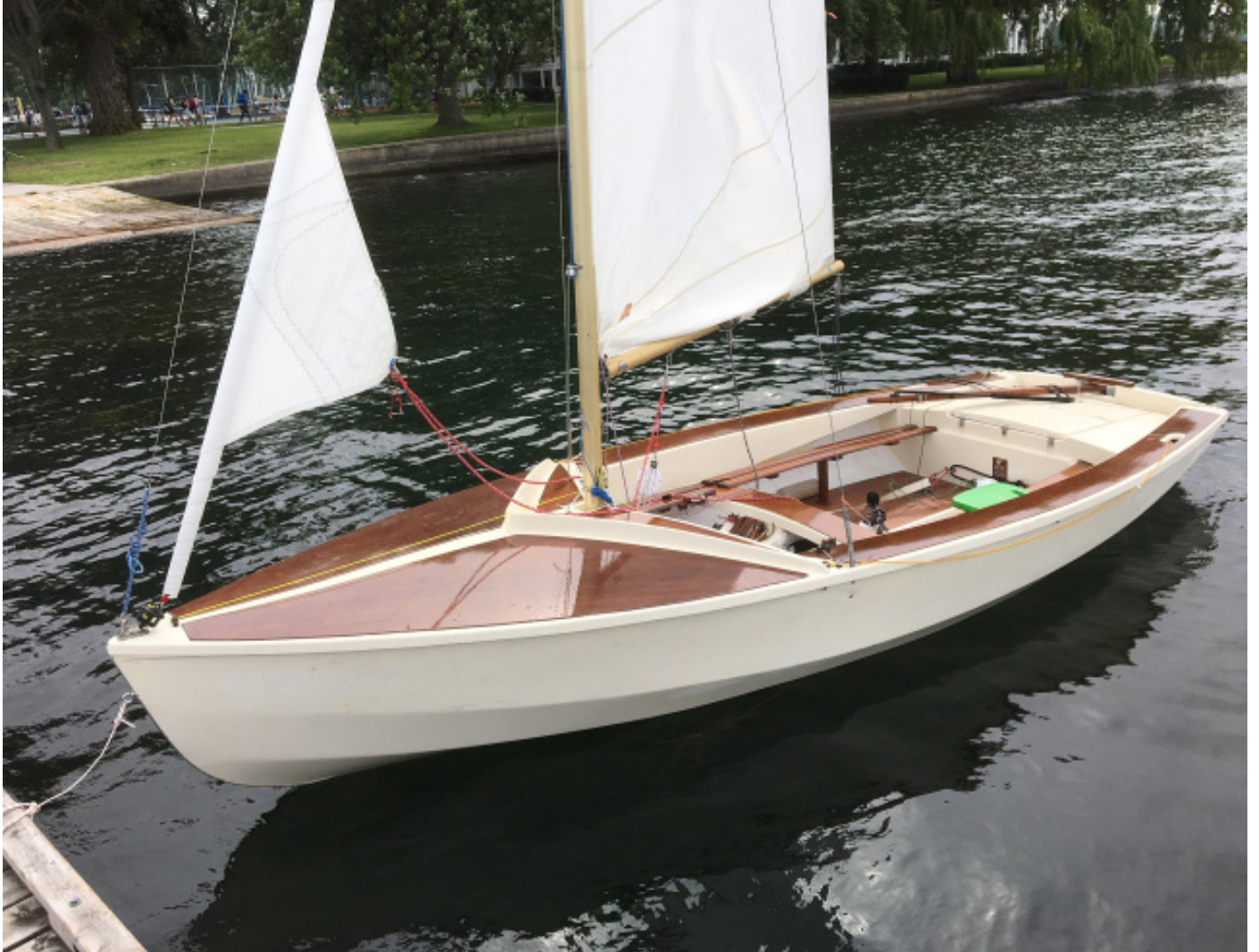
Ready to sail - the finished boat