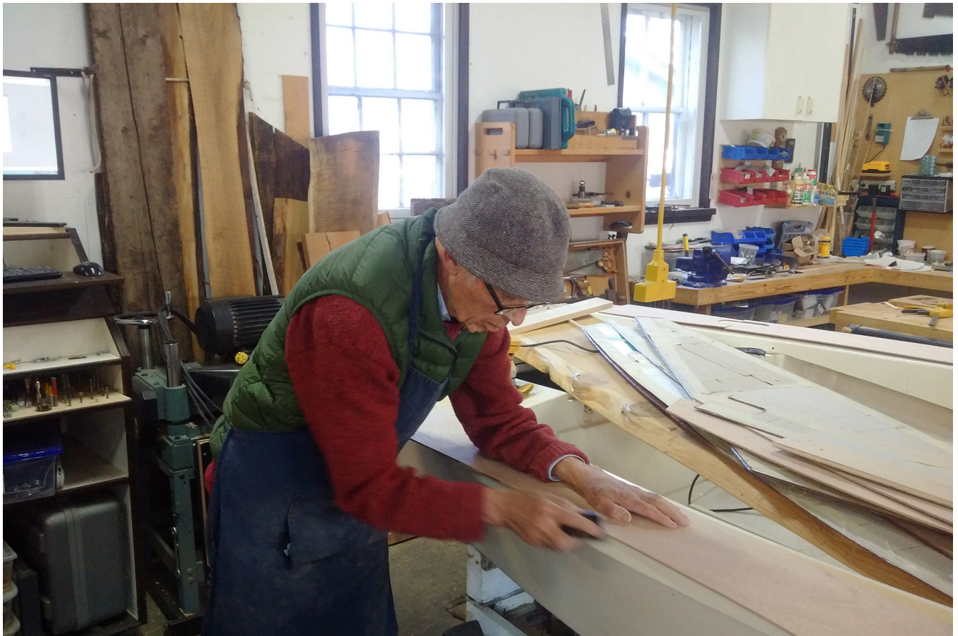
Fitting and edging the 4mm mahogany deck panels