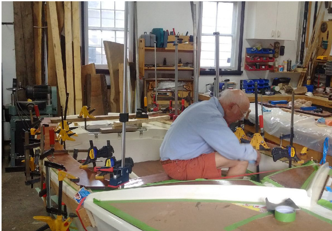
Bonding the mahogany side panels with a frame to apply uniform pressure