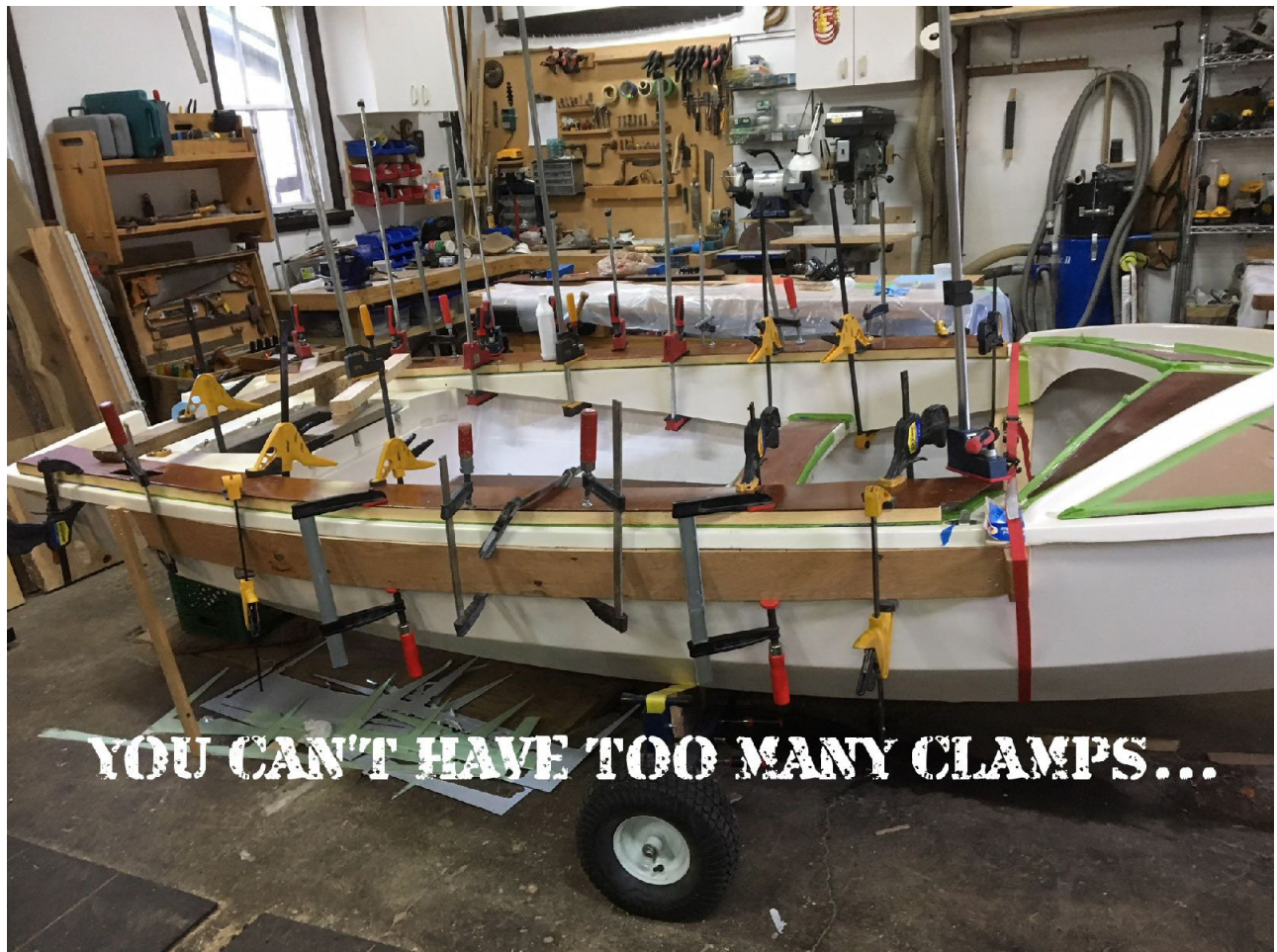
Bonding the side panels - and - as Steve says: "You can't have too many clamps!"