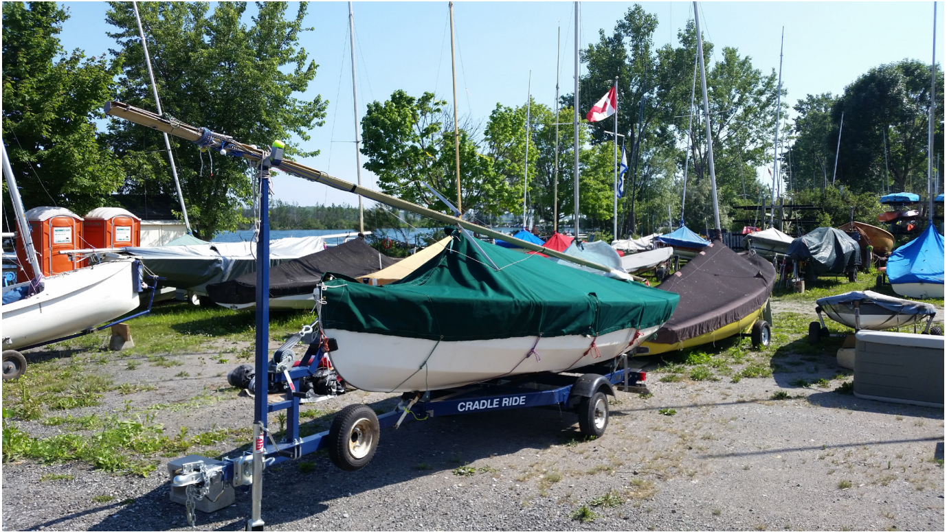
The boat at its new home - the Outer Harbour Centreboard Club. The old trailer was sandblasted, painted and equipped with new rollers, latch, winch and a mast support by the Marine Cradle Shop