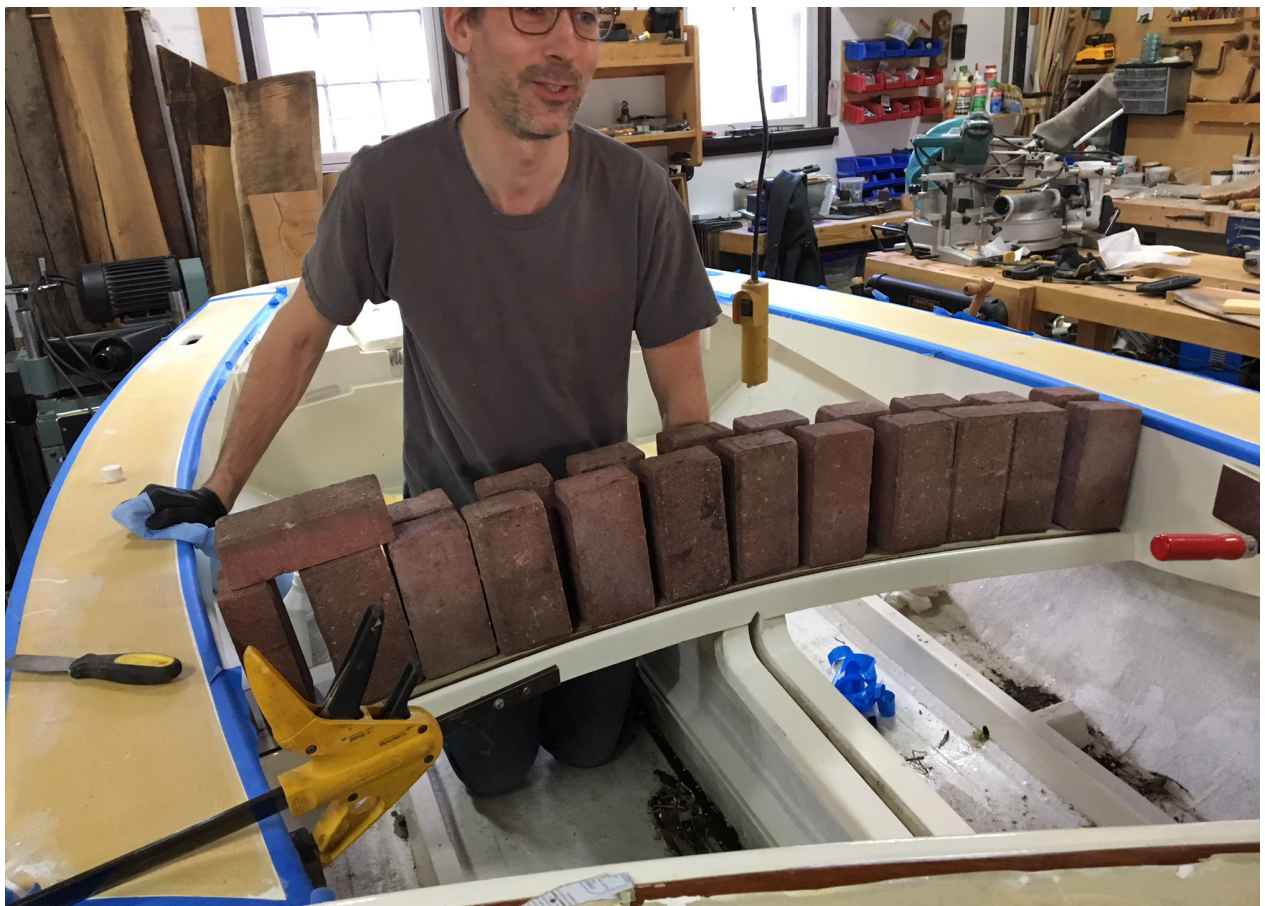
Bonding the mahogany panel to the athwartship section