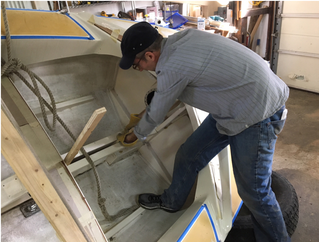
Boat has been moved to Steve Crow's shop in Dundas, Ontario.