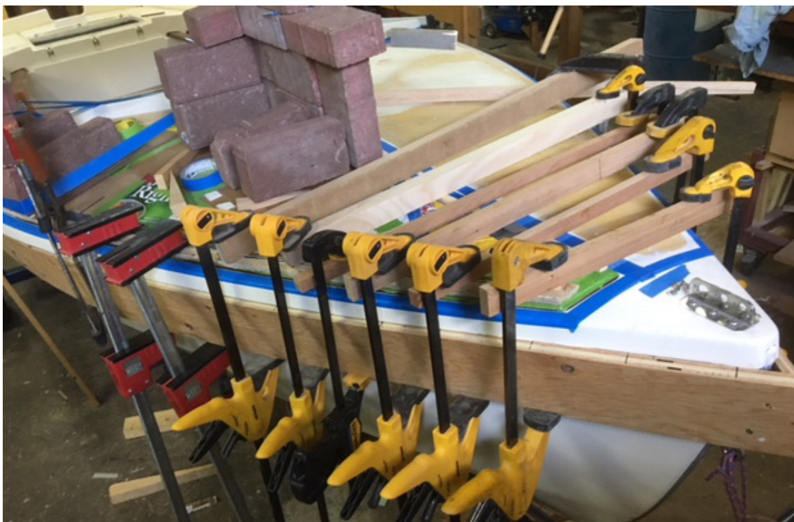
Bonding the mahogany panel - the forward starboard section