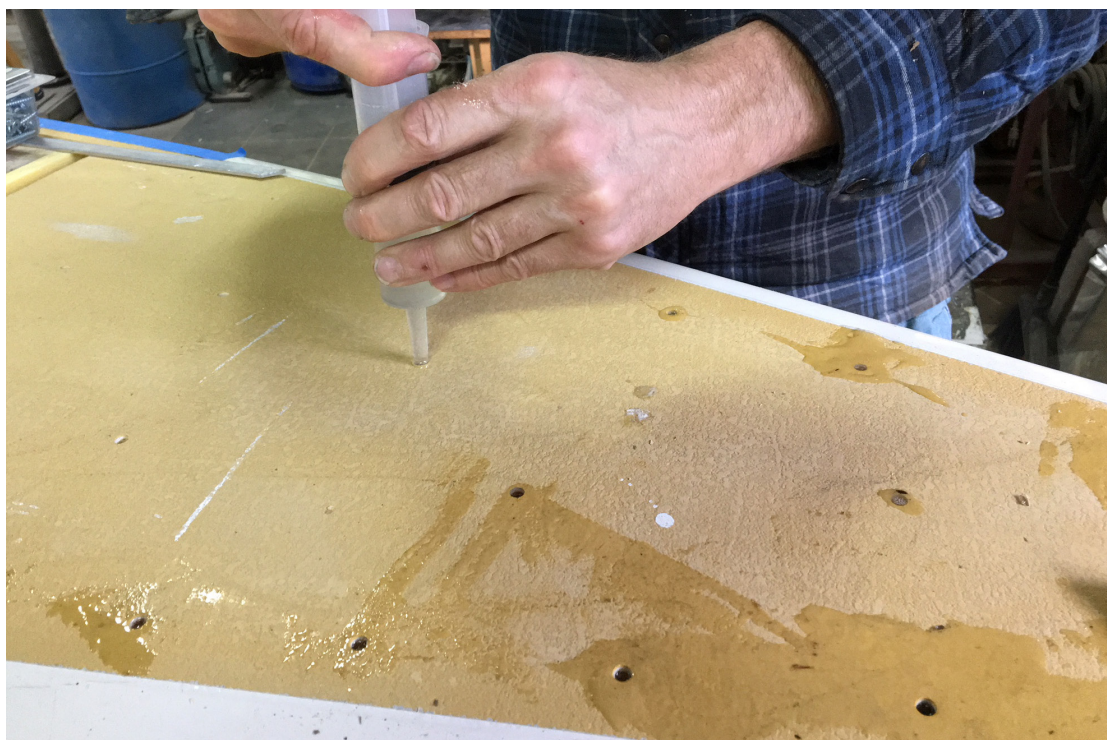
Forward of the repair area expoxy is squeezed through holes into the balsa to re-bond any possible voids