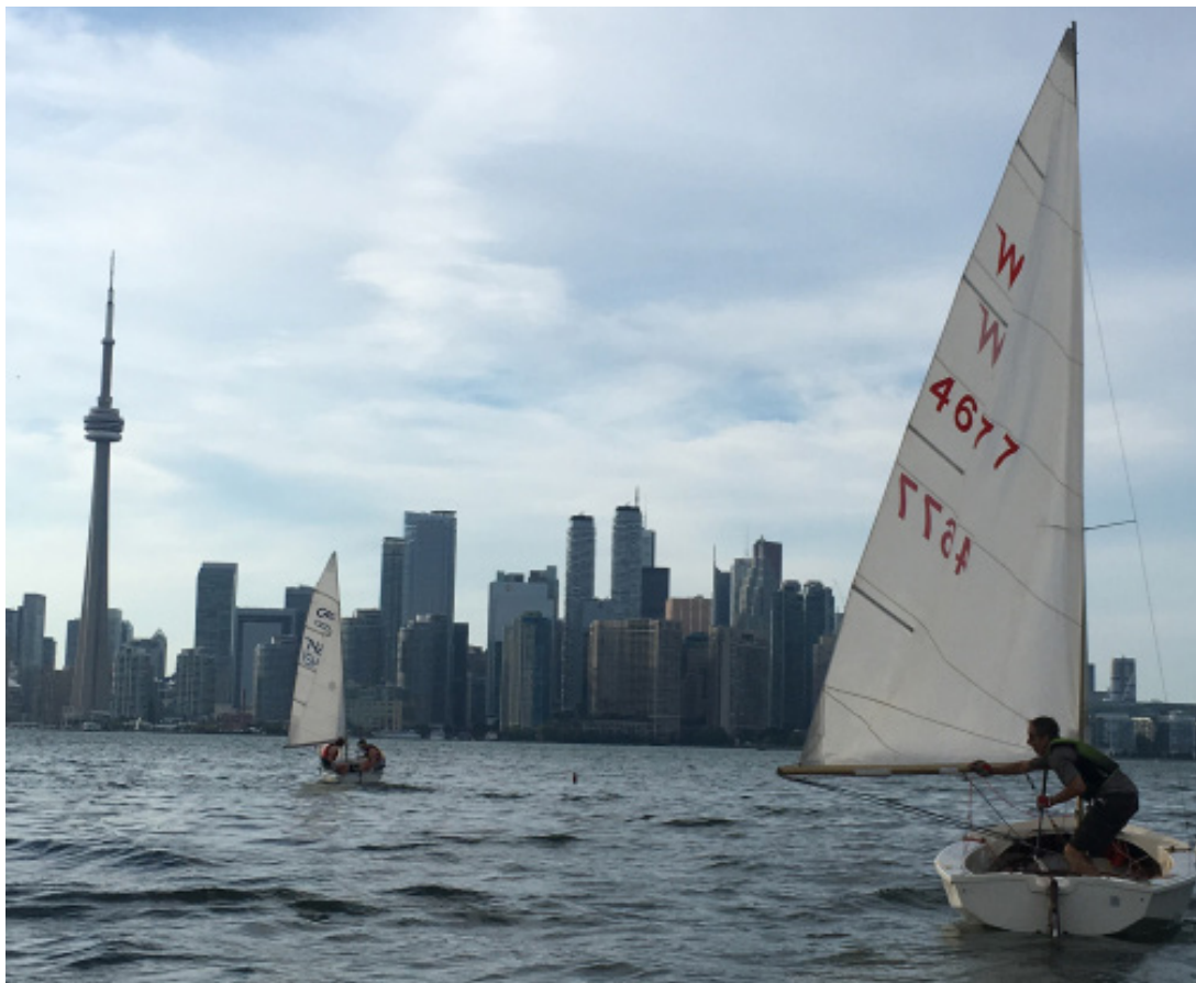
Wayfarer 4677 - single handed sailing - taking of from the RCYC