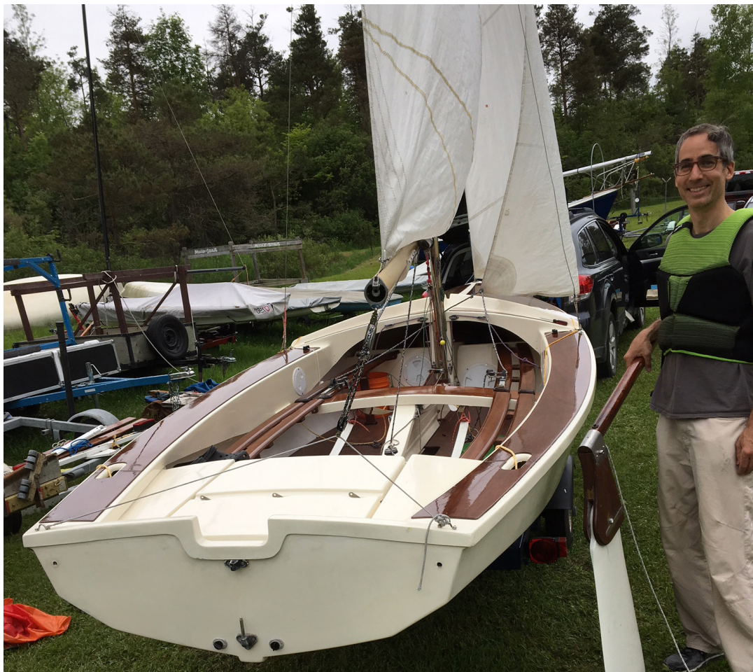
Ready for first sail at the Conestoga Sailing Club in June 2018