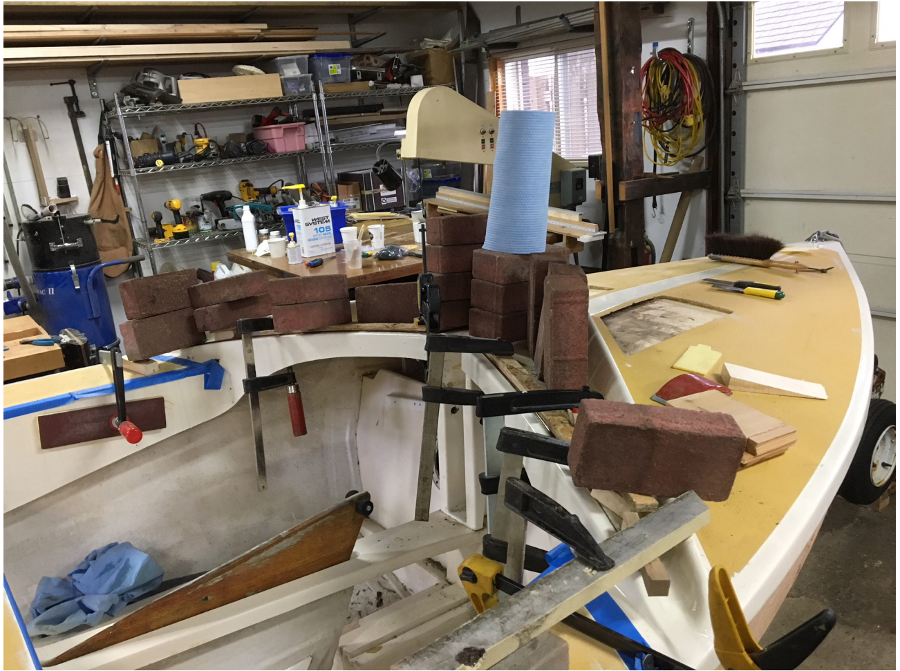
More bonding of the mahogany sections