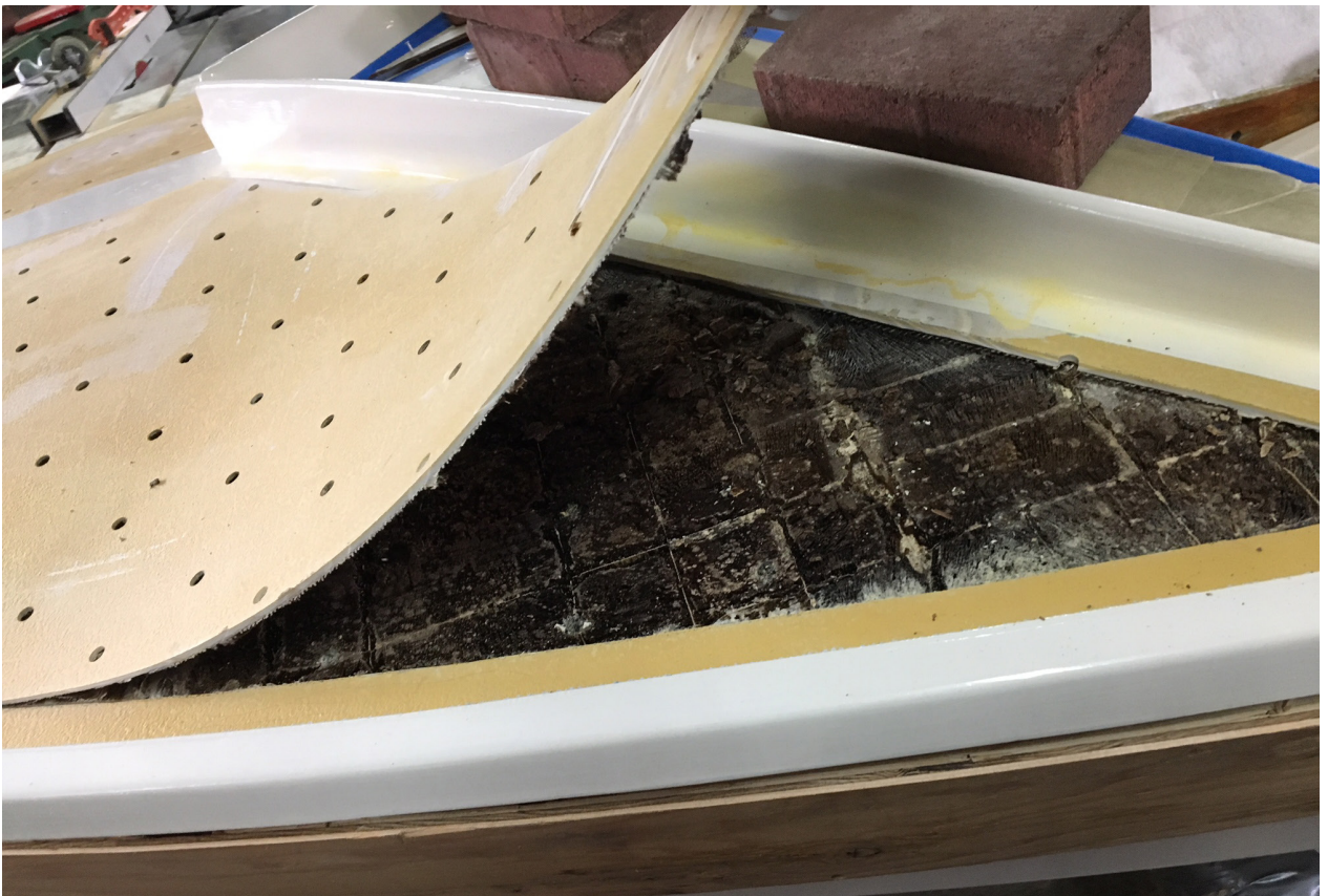
Unsuspected problem: the cause of the soft deck was the rotten balsawood core. Balsawood turns black when it rots.