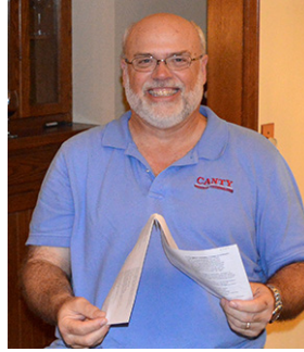
By Phil Leonard Fleet 15 Commodore W864

The Old Brown Dog regatta has been moved from the