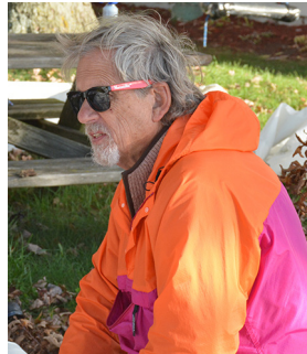
By Robert Mosher USWA Cruising Secretary W11341

1.1. Sufficiently stable so the whole crew can sit on the gunwale without dipping it under the water. 1.2. With sufficient positive buoyancy to support stores and crew when flooded,