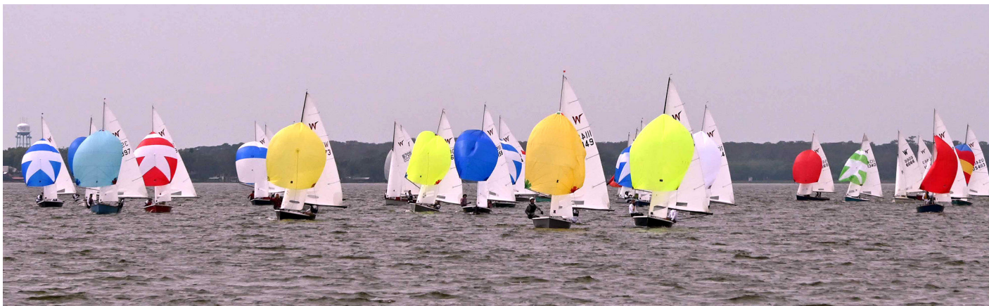
The stunning Wayfarer fleet spreads out across Lake Eustis. The championship series featured 11 Olympic course races (triangles), which meant those not accustomed to reach-to-reach spinnaker jibes got a lot of practice through the week.