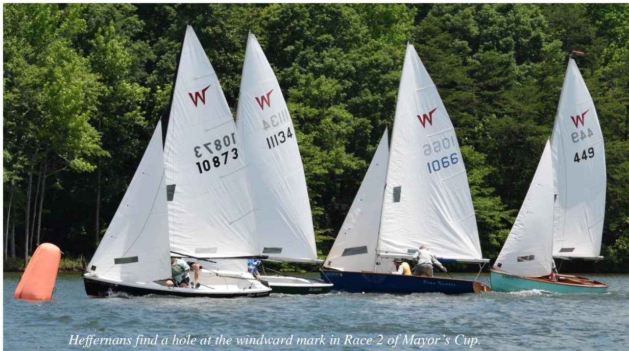
Heffernans find a hole at the windward mark in Race 2 of Mayor's Cup.