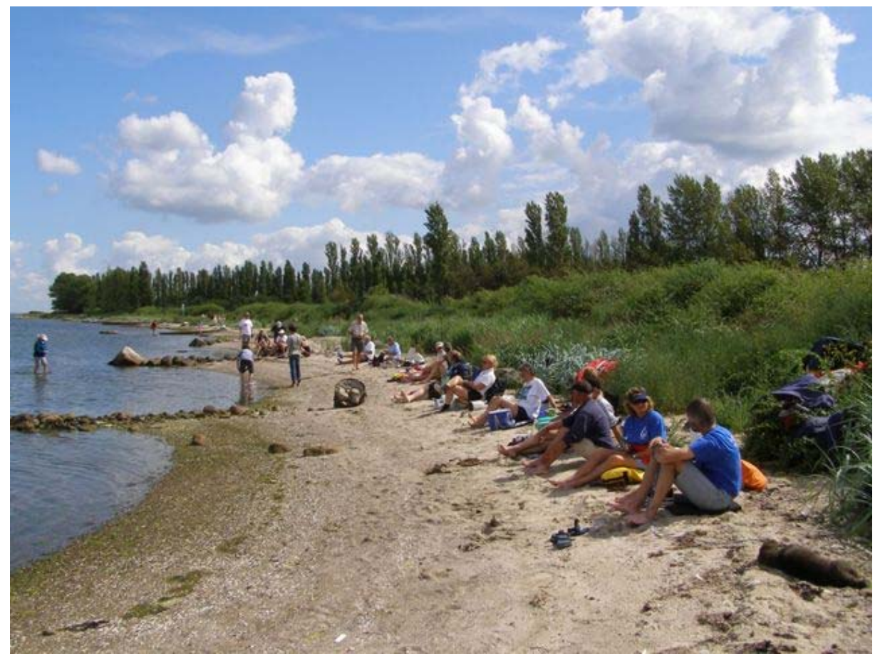
Happy sailors on the Northern beach of Little Island.