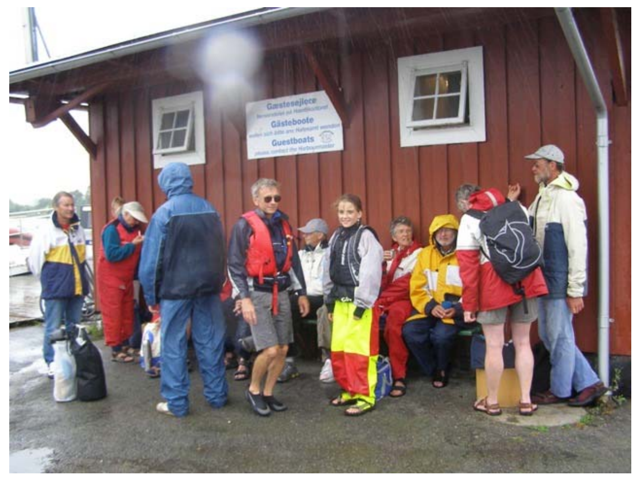
Wet Wayfarers wait for the rains to stop.

wet clothes out to dry and drove over to Tars to book a spot on Sunday's ferry. Then it was on to Nakskov (a town) (- to find a pizzeria so that we could still our hunger pains. A simple meal. Around 10, we were back in our cabin. Fatigue was making its presence known, and it wouldn't be long before we would be snug in our beds.