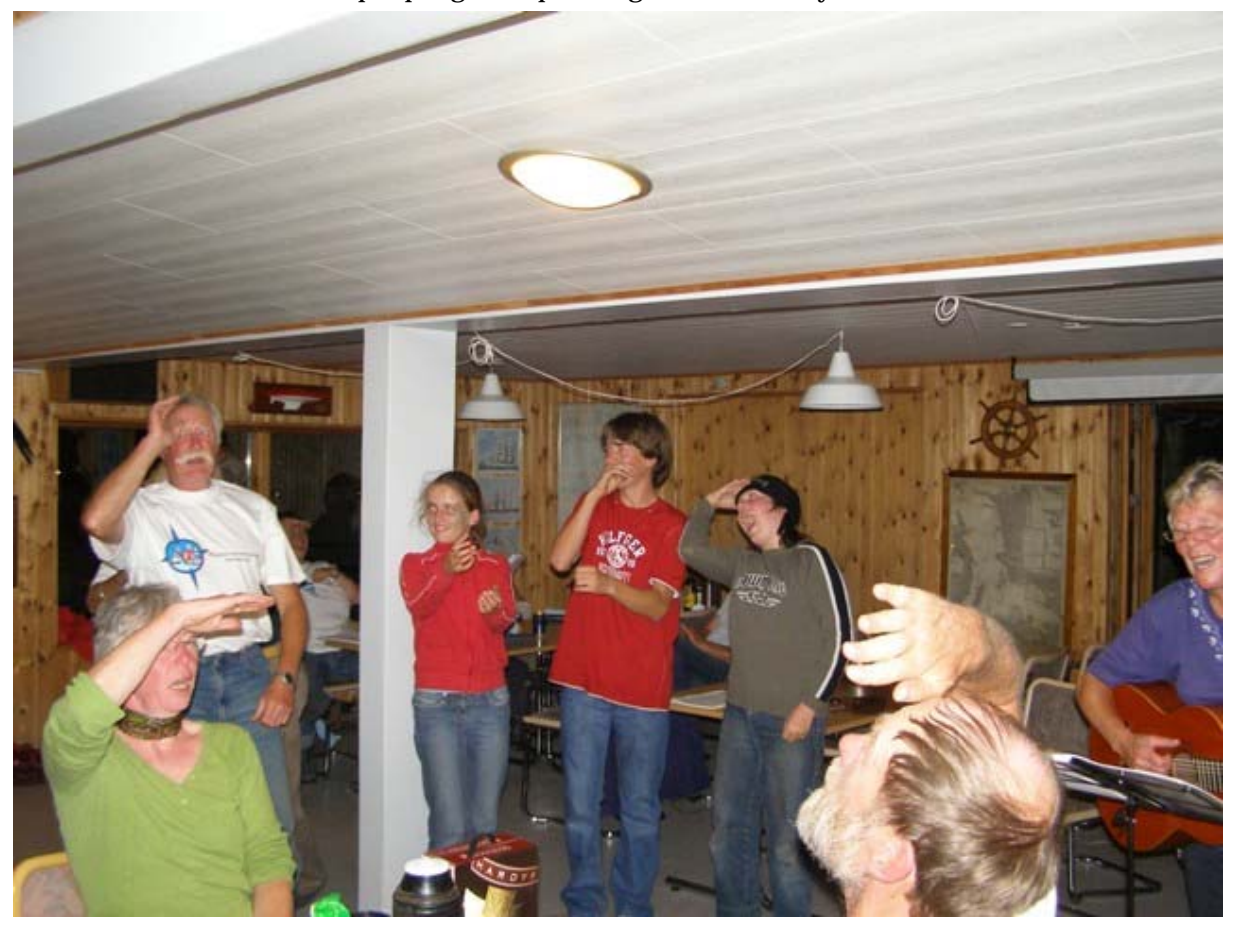
The wreck of the sloop John B with gestures

Soon we were ready to set sail. It was getting on for 1530 and the winds had died down a fair bit. John replaced the jib with a genoa. The consensus of opinion was that we should go east around Ask Island and then south around Lindholm (a small Island). It was a beat all the way to Lindholm. After that, peacefully and quietly back to Kragenes. There were big differences in what winds people got, depending on where they were.