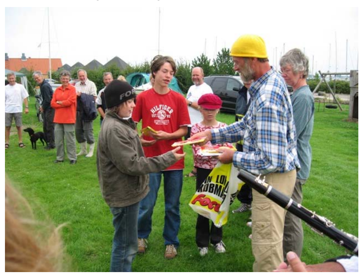
More little something for the young people

"It will be sunny, it will rain, it will blow, winds will be calm, we will get sleet and snow and frost - before we meet again. (lots of laughter)