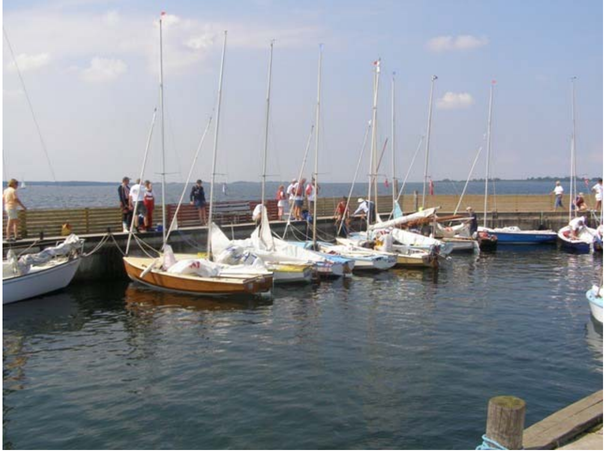
Wayfarers in Skalø (Shell Island) harbour

After our hike, we enjoyed a cup of coffee, and there were even a few of us who had a little swim before we got back into the boats and got ready to sail back home.