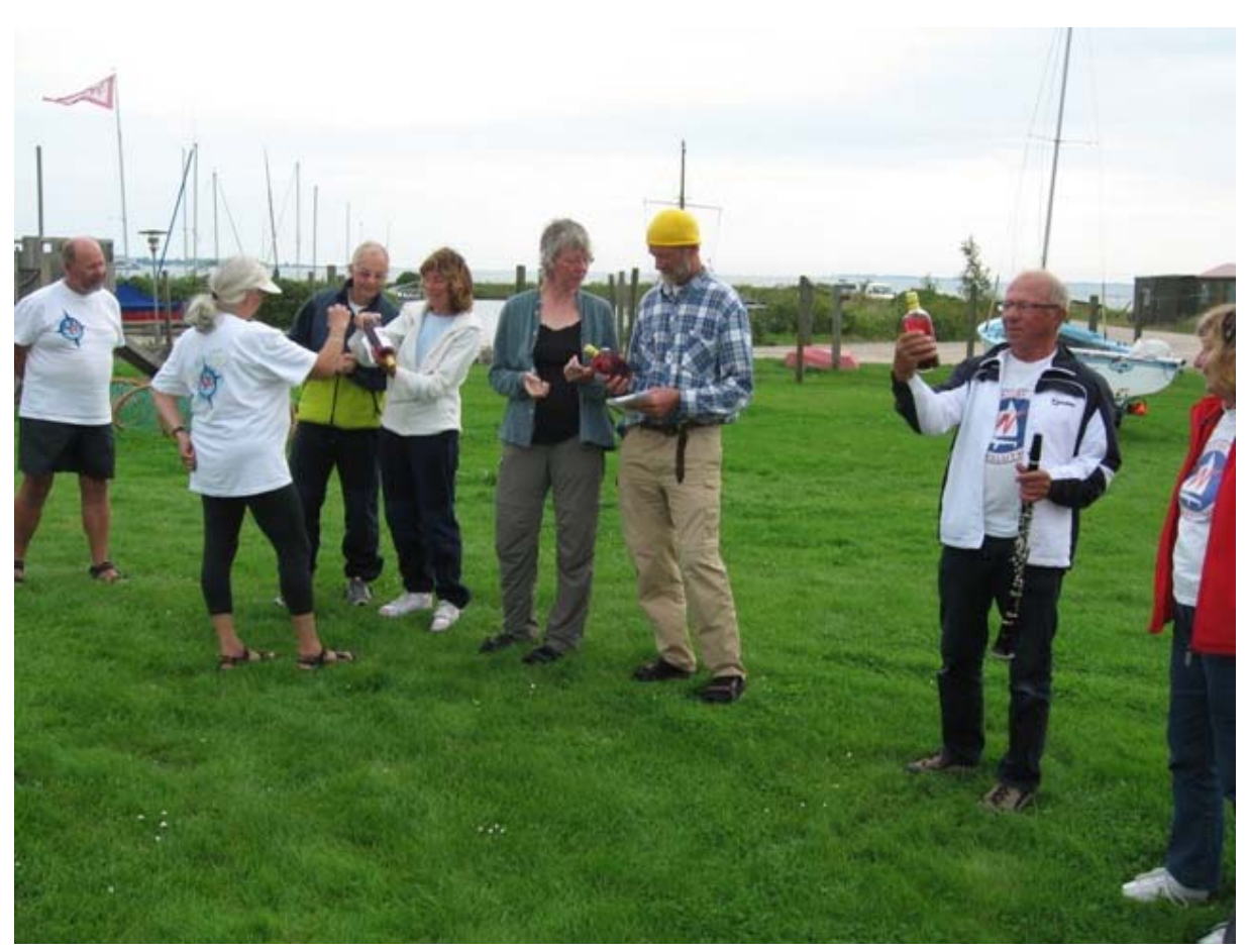
The well-kept secret surprise, bottles of Sloe Gin to the Rally Committee