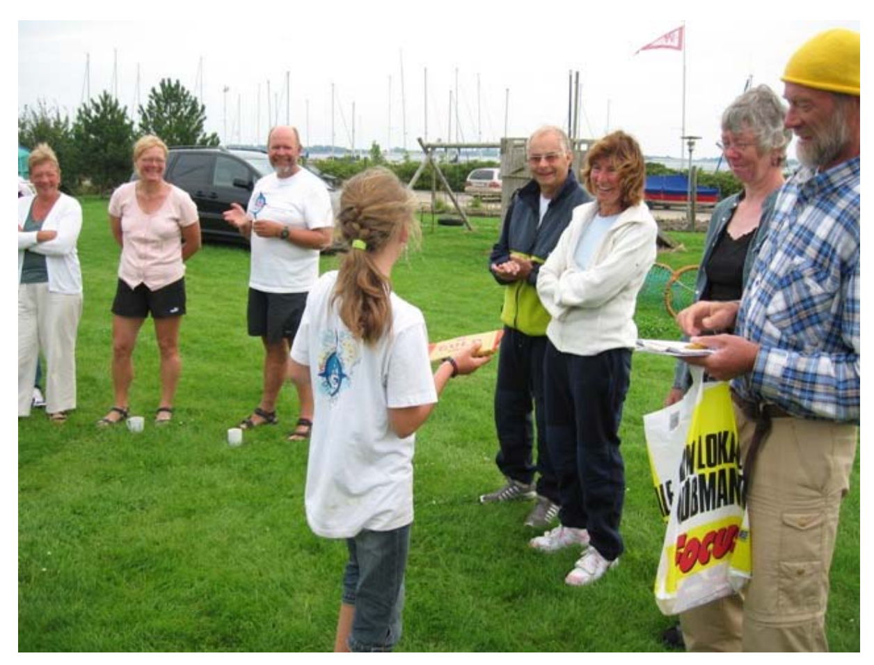
A little something for the young people