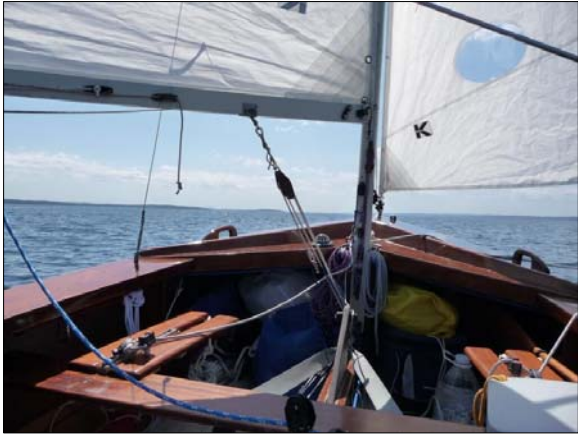
South to Traverse City

Everything went as planned. The wind switched to the NE and kept building. I ended up surfing south during much of the afternoon's 16-mile run. Top speed recorded on my GPS was 7.8 mph.