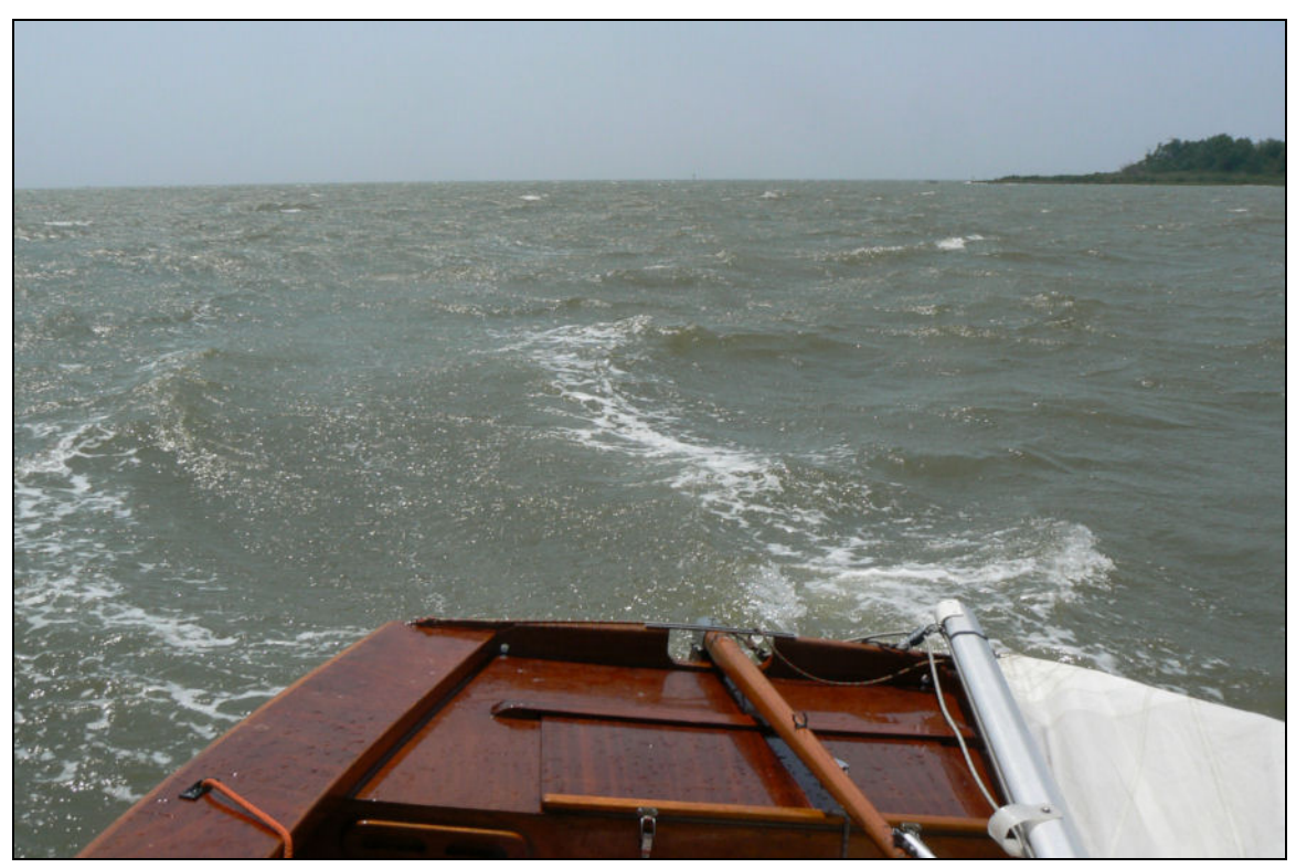
The approaches to Crisfield harbor: Hans and Al follow us in under jib alone

W1321 showed me her pedigree that day. Within minutes of leaving the harbor, we were wet from head to toe from the spray over the bow. But as we came around the top of Smith Island and started reaching and skimming over the water, I was yelling war cries! Maybe I was just letting my anxiety out. Anyway, if I had had time to look back, there were probably some rooster tails back there. It seemed as if we were barely in control. But, I never felt like we were going to capsize. The Wayfarer really is sea-kindly just like the web talk purports.