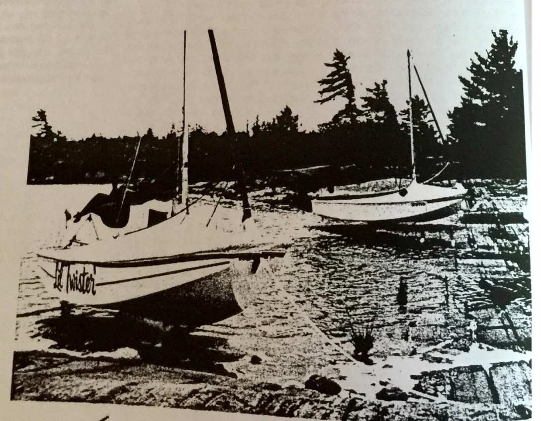
THE CRUISING MIRROR AT REST. 12

6. Buoyancy Tanks for Stowage: inch hand hole covers enables the of buoyancy tanks for limited stoward the access is narrow and it is difficusee inside. Most important — the propurpose of the tank is not for storage.